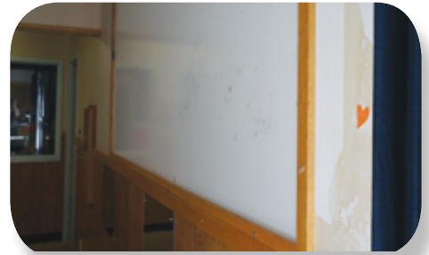
Peeling paint and damaged walls